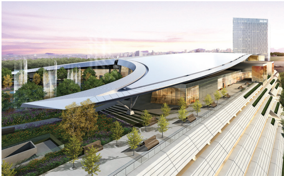
MGM Resorts International is building the MGM National Harbor Resort and Casino in National Harbor, Md., slated to open in 2016. IMAGE COURTESY OF HKS ARCHITECTS

Large owners are pushing contractors to create workforce development programs to ensure sufficient craft labor for ramped-up construction plans